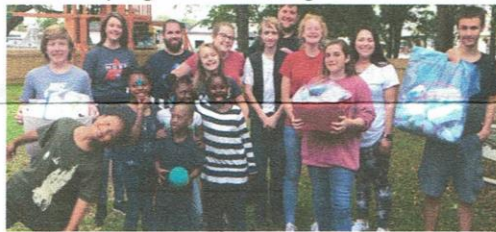
Together, our families and yours

Our program is evolving based on the needs of our guests. Last year we reported that most of our parents required additional skills in order to succeed. To respond, in January 2018 we began a few new initiatives to our program: Parenting Skills and Financial and Budget Management. As we know good parenting is a