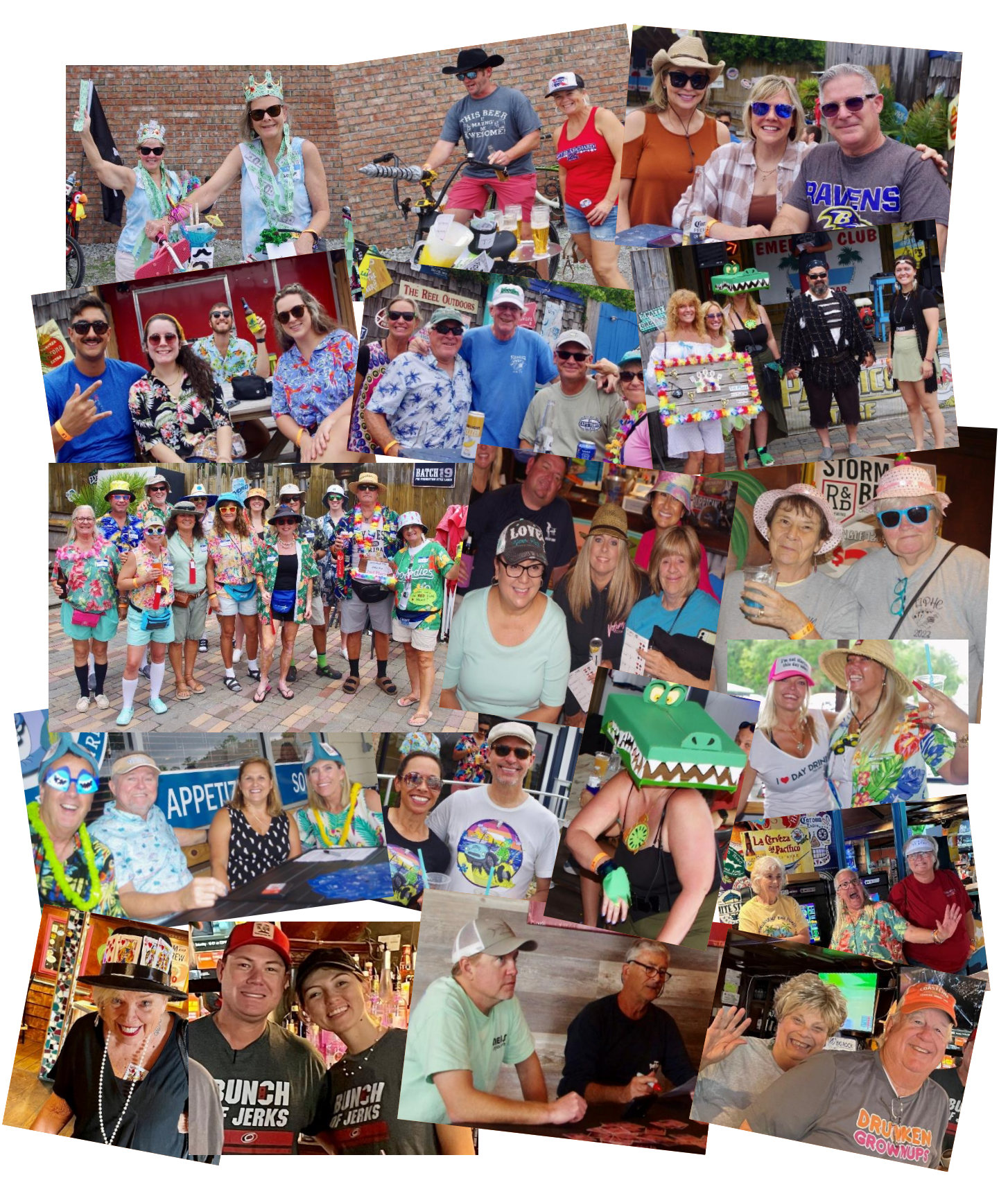
*Page 3 of 8